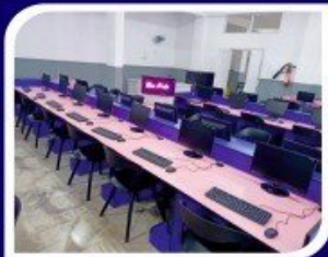
WELL EQUIPPED LABS

ADMISSIONS OPEN Class XI (session 2024-25)